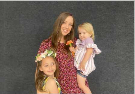
MOTHERS DAY CELEBRATION