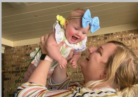
MOTHERS DAY CELEBRATION