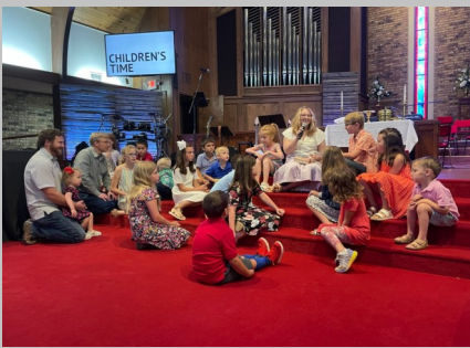
SENIOR DAY CHILDREN’S TIME